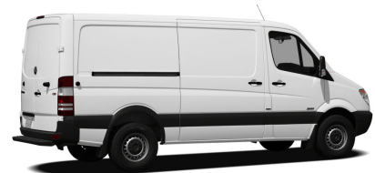
control inputs - rear car lights